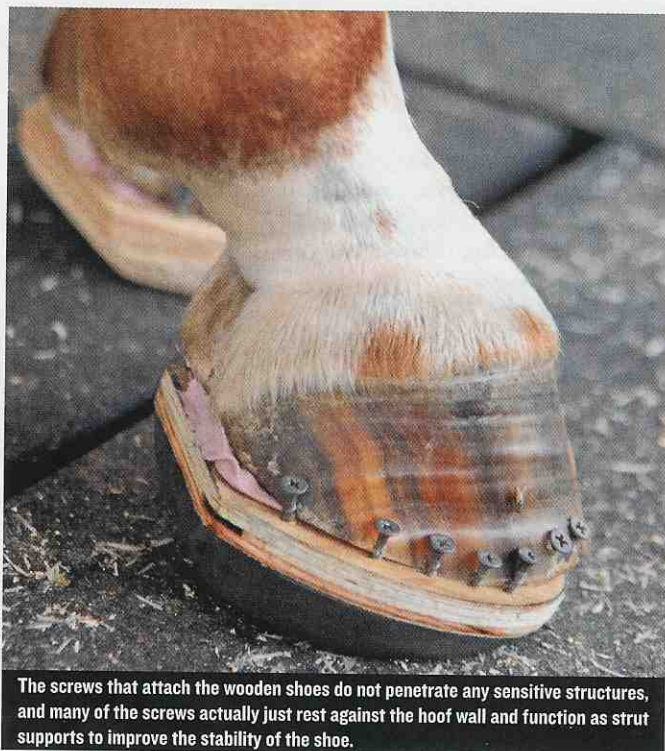
The screws that attach the wooden shoes do not penetrate any sensitive structures, and many of the screws actually just rest against the hoof wall and function as strut supports to improve the stability of the shoe.

If the hoof breaks over at a point toward the front of the foot, more force is applied to the deep digital flexor tendon at the back of the leg – which worsens the laminitic horse's pain. But if the breakover point is moved back, toward the middle of the hoof so that the hoof rolls easily over in the stride, the horse is much more comfortable.