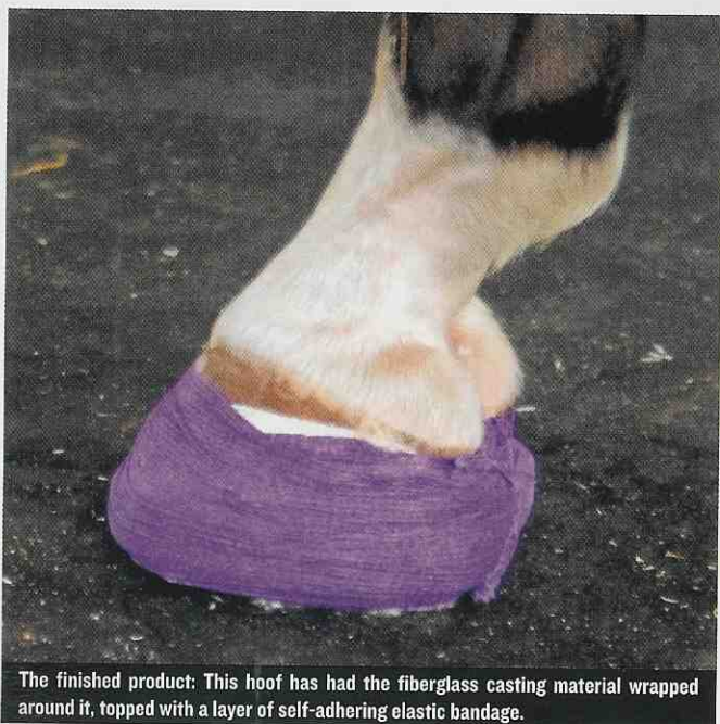
The finished product: This hoof has had the fiberglass casting material wrapped around it, topped with a layer of self-adhering elastic bandage.

coming through her soles and whose owner couldn't afford expensive treatments.